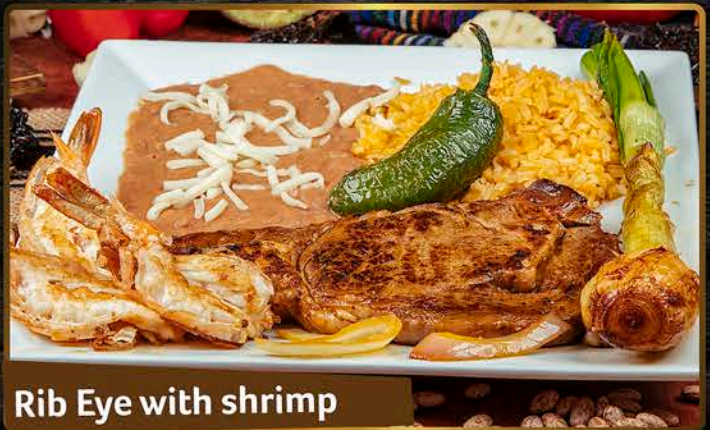
Rib Eye with shrimp