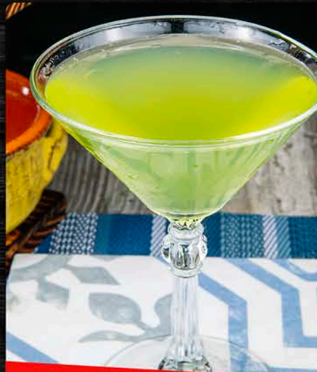
Green Apple Martini