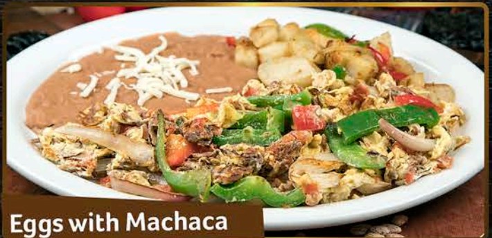
Eggs with Machaca