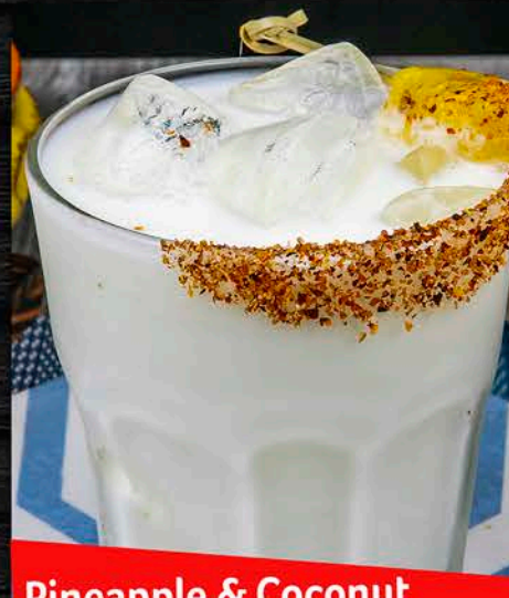
Pineapple & Coconut Margarita