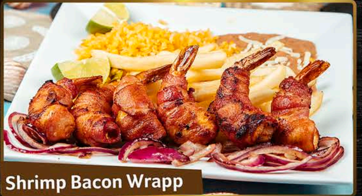
Shrimp Bacon Wrapp