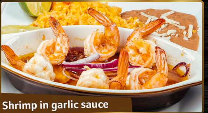
Shrimp in garlic sauce